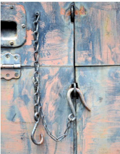
Color Print by Alan Forney